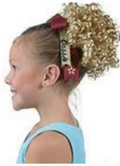
High Curly Ponytail - (hairpiece optional)