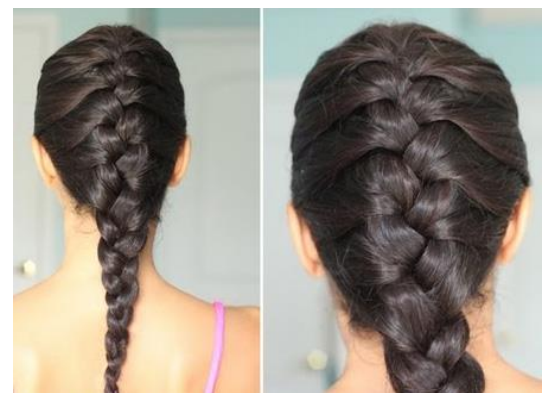
Single French Braid front must be slicked back