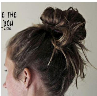
Messy bun - bun pictured Ok, but sides must be slicked back