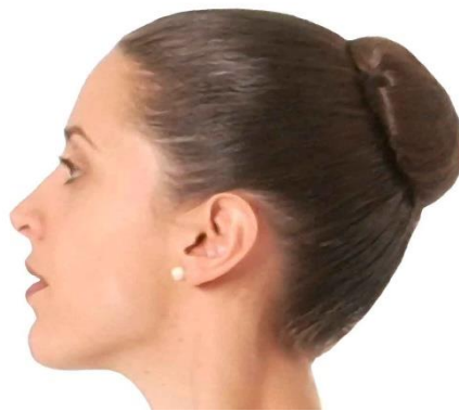
Classical Ballet Bun