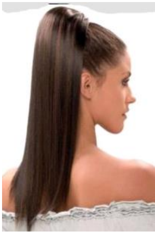
Straight Ponytail - use a “Straightener”