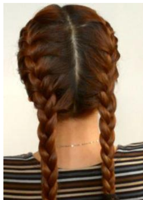
French Braid front must be slicked back